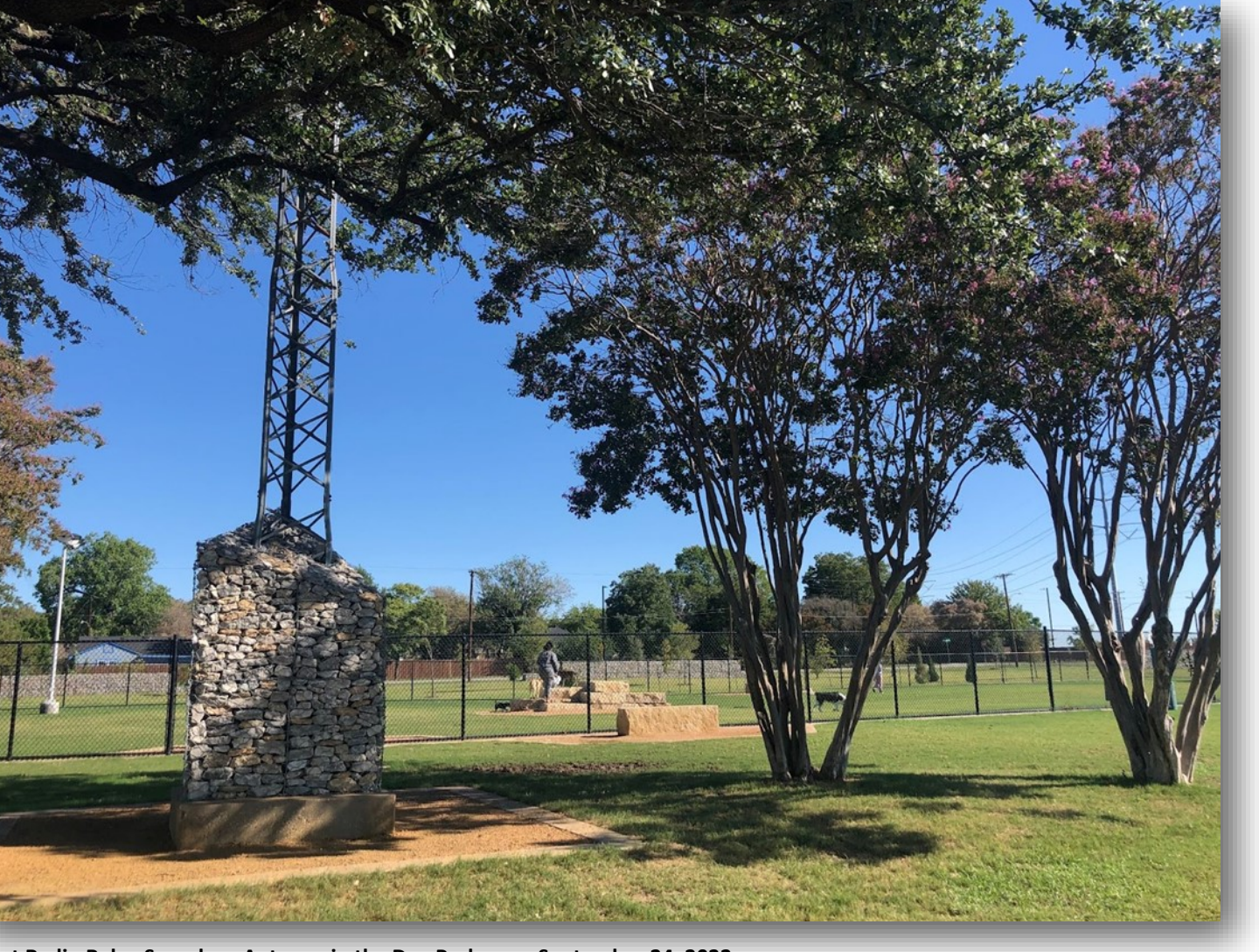
221st Radio Relay Squadron Antenna in the Dog Park area, September 24, 2022.

to the Dog Park today can see all four antennas standing silently on guard reminding them of the men and women who served for almost sixty years in the 221st Radio Relay Squadron, the 221st Mobile Communications Squadron, and the 221st Combat Communications Squadron.