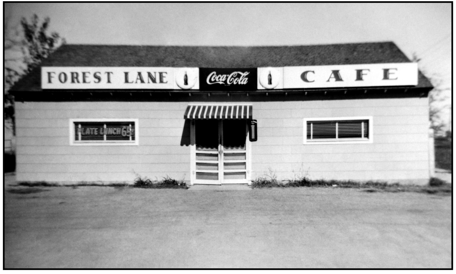
Cook's Forest Lane Café, 2355 Forest Lane, filled many Garlandites' breakfast and lunch needs from 1952 to 1980. This image graced their Christmas card ca. 1960, when a 'plate lunch' cost 65 cents.

28 years of serving blue collar, white collar and even the occasional celebrity.