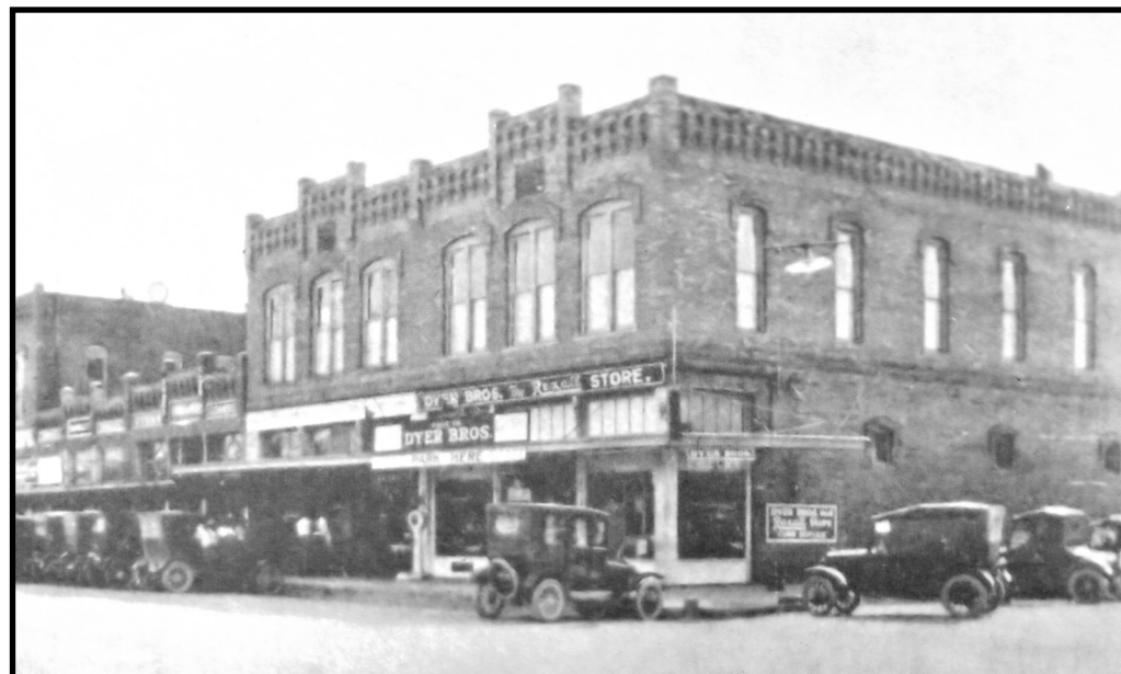
Dyer Bros. drug store, corner of Sixth and State Streets.